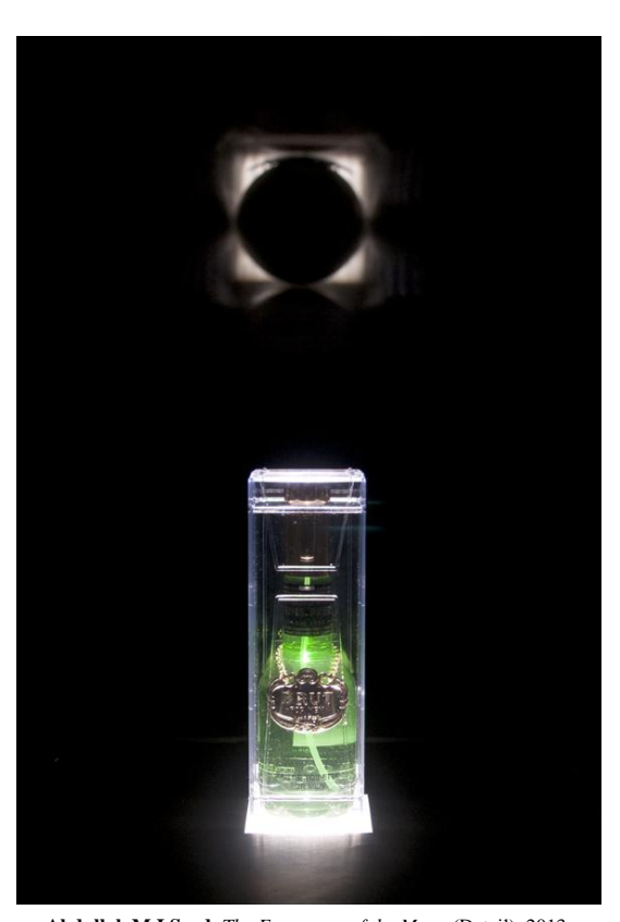
Abdullah M I Syed, The Fragrance of the Moon (Detail), 2013, Brut for Men fragrance bottle, Perspex and transparency projector, Dimensions variable.

The title Brut-Nama: The Chronicles of Brut alludes to the immensely popular fragrance, Brut for Men, launched by Faberge in 1964. Designed to create a new market for male grooming products under the slogan "The Essence of Man," Brut set itself up as a catch-all symbol attempting to embody a swarm of conflicting notions of traditional masculinity, strength and character, while its extreme binary, signified by the word brute, implied the inherent power make it so by sheer force of will. In contrast, the work in Brut-Nama presents a series of nuanced, complex and interlocking visual chapters, portraying contemporary Pakistani masculinities ranging from brutish, the raw and unrestrained, to the cultured, gentle and atypical. The exhibition explores the very essence of the dichotomy of the word Brut (e) through chance, experimentation, collaboration and real and imagined narratives while drawing on an obsession with the effects of history and geography on questions of performed identity and the construction of multiple contrasting 'Others'.