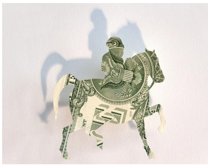
Abdullah M I Syed, Assembly 1 (Detail – Horseman I), 2013, Hand-cut U.S. currency, Dimensions variable.

to Pakistani arts-and-craft traditions, such as hand woven rugs, garlands made from currency and the more recent urban Pakistani fascination of adorning commercial trucks with intricate hand-beaten metal reliefs and hand-cut stickers. Recognized as a masculine domain, such crafts are undoubtedly a rich source of imagery, which - previously muted - are now richly colored. In Brut-Nama, all of these outsider elements find their way into Syed's formally meticulous practice. Exuberantly colored out-sized handmade Brut for Men medallions are set off by flashing neon signs and balanced by quietly powerful hand-woven and cut works assembled from uncirculated U.S. currency. Ethereal moonlike sculptures radiate light through surfaces woven of countless Muslim skullcaps while textbased and collaborative installations juxtapose the earnest and the ironic both within and amongst works.