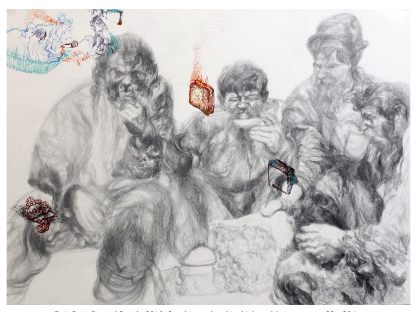
Puja Puri, Ragged People, 2010, Graphite and archival ink on fabriano paper, 22 x 30 in.

Puja Puri merges layers of meticulous monochromatic drawing to effect remarkably fluid final compositions, with variations in detail – from sketchy gestures to defined contours – at selected points of focus. The effect is an allegory of whimsical memory, with prominent contrasts between areas of refinement and the artist's ultimately loosely drafted, dream-like visual renderings of bustling amorphous scenes.