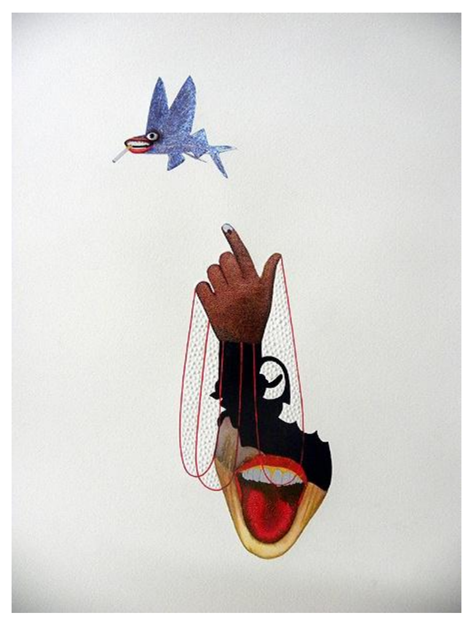
Avishek Sen, Untitled 7 , 2010, Mixed media on paper, 18.5 x 24 in.

Avishek Sen's collage-based work investigates the myriad sociopolitical concerns of contemporary Indian society through augmented allegories, built up out of images referencing personal experience, political and religious history and popular culture. The juxtaposition of traditional icons – borrowed from myths, epics and manuscripts – with elements of a contemporary India still dealing with fundamental issues of poverty and inequality lends the work a questioning and often unsettling political undercurrent central to the artists concerns and practice.