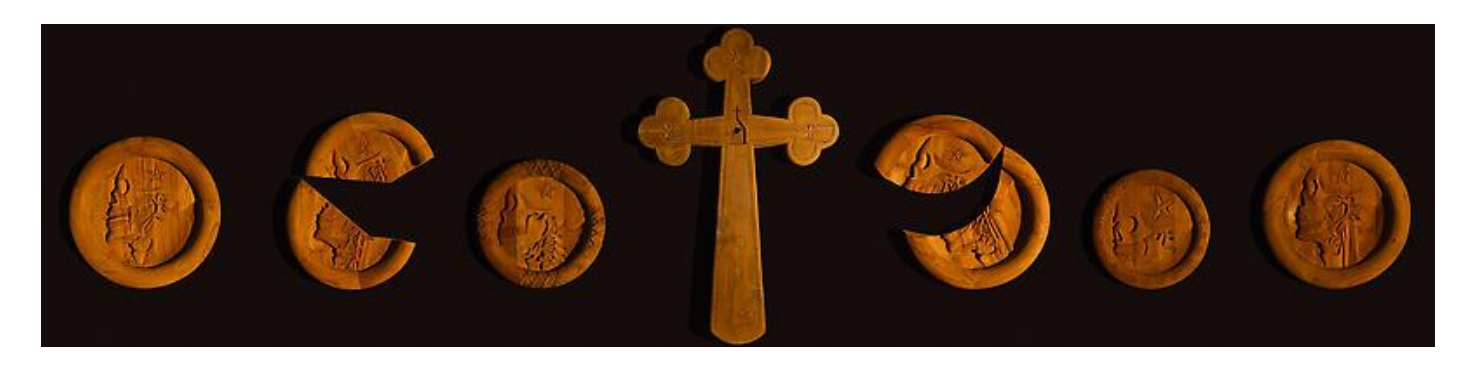
Riyas Komu, Old New Belief and Unclaimed Dead Bodies, 2008, Wood and mixed media, Dimensions variable

In "New old beliefs and unclaimed bodies" Riyas Komu uses the unique woodworking style he developed over the last two years--starting with pieces of wood patched together and glued, seams left visible, then intricately carving them into sculptures and bas-reliefs of stylized musculature and bone--to take on a theme that fascinated Souza: the body of Christ. Komu flanks an Indo-Portuguese wooden cross with a set of five wooden roundels. They are at once skeletal profiles, memento mori, and evocations of the host broken and distributed in the Catholic Eucharist. The arrangement is intended to recall Christ's last supper and its ritual reenactment, where the communion bread miraculously transubstantiates, and becomes the flesh of God. Komu effects a transubstantiation of his own in this piece, binding salvaged wood fragments into new wholes, smoothing and carving them into painfully beautiful and deathly anatomical forms. As with Souza, there is a deep referencing of the material aspects of Christian rites and religion, and a manifest skepticism with regard to its metaphysical promises: the "new old beliefs" and the "unclaimed bodies," left unwanted and unredeemed, never quite meet.