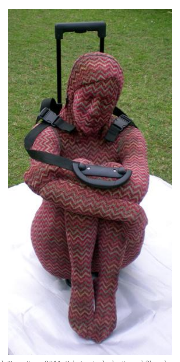
Nausheen Saeed, Transitory , 2011, Fabric, steel, plastic and fiberglass, 33 \times 15 \times 20 in.

Nausheen Saeed's disquieting sculptural works blend the female form with that of traveling luggage, synthesizing the vessel and body as a singular entity. By presenting women as solid, permanent beings – contradicting their traditionally marginalized role in Pakistani society – while simultaneously recasting the female body in purely utilitarian, functional forms, the work evokes a paradox of thoughts, attitudes and behaviors surrounding conflicting notions of femininity. The figures are modestly naked, covered by functional materials and domestic textiles, further emphasizing the duality of women as containers of life and as possessions, mixing feelings of helplessness with elements of beauty.