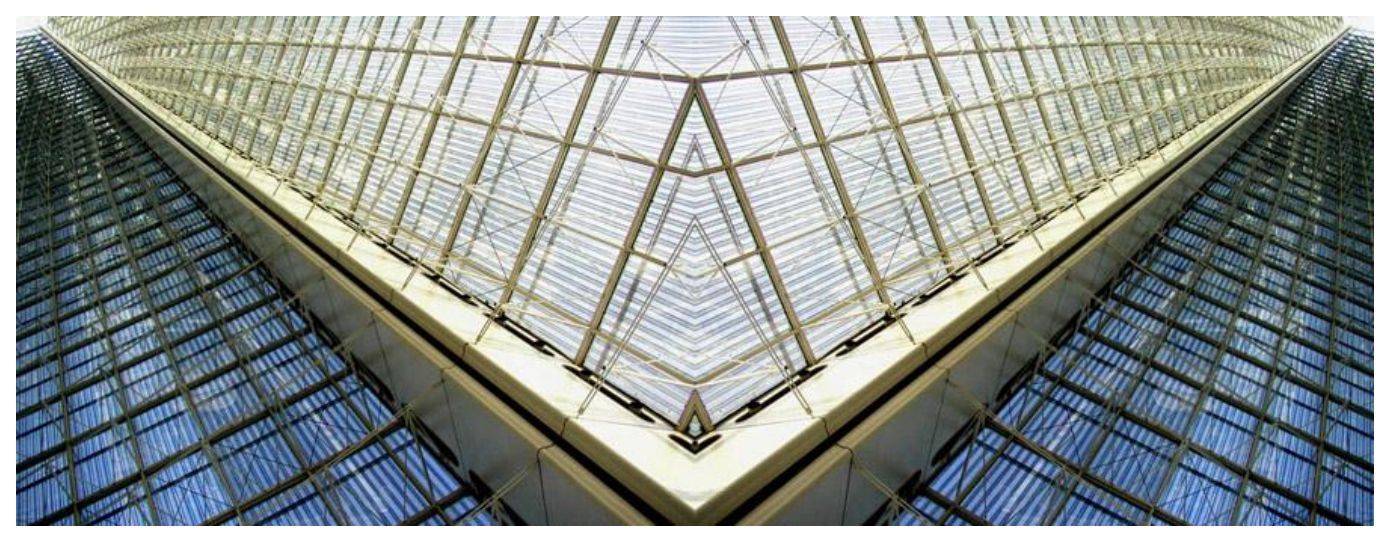
Pooja Iranna, Reflective Energies II , 2008, Photo-print on paper, 32 x 63.5 in.

Pooja Iranna's striking large scale photo-works explore how man-made structures and environments reflect the ambiguous constructs inherent in how human beings interact both with one another and with our environment. Building upon form, repetition and perspective to develop complex compositions focusing on linear and directional elements of design, the artist captures the eternal and overarching struggle of order and chaos, representing the duality of strength and frailty manifest in humanity's undertakings both contemporary and throughout the millennia.