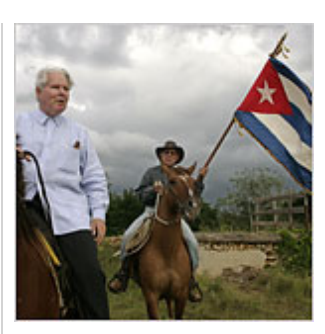
More U.S. Exporters Deal with Cuba, Politics Aside