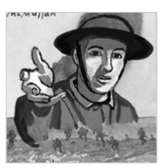
Op-Ed: Over There, and Gone Forever