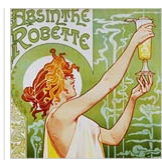
The Return of Absinthe