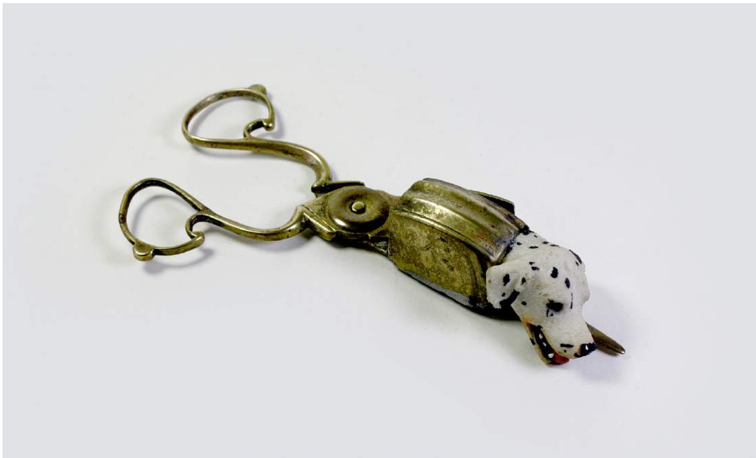
Affan Baghpati Clip , 2020 Assemblage, found objects, brass, polymer resin 1.20h x 6.50w x 2.40d in