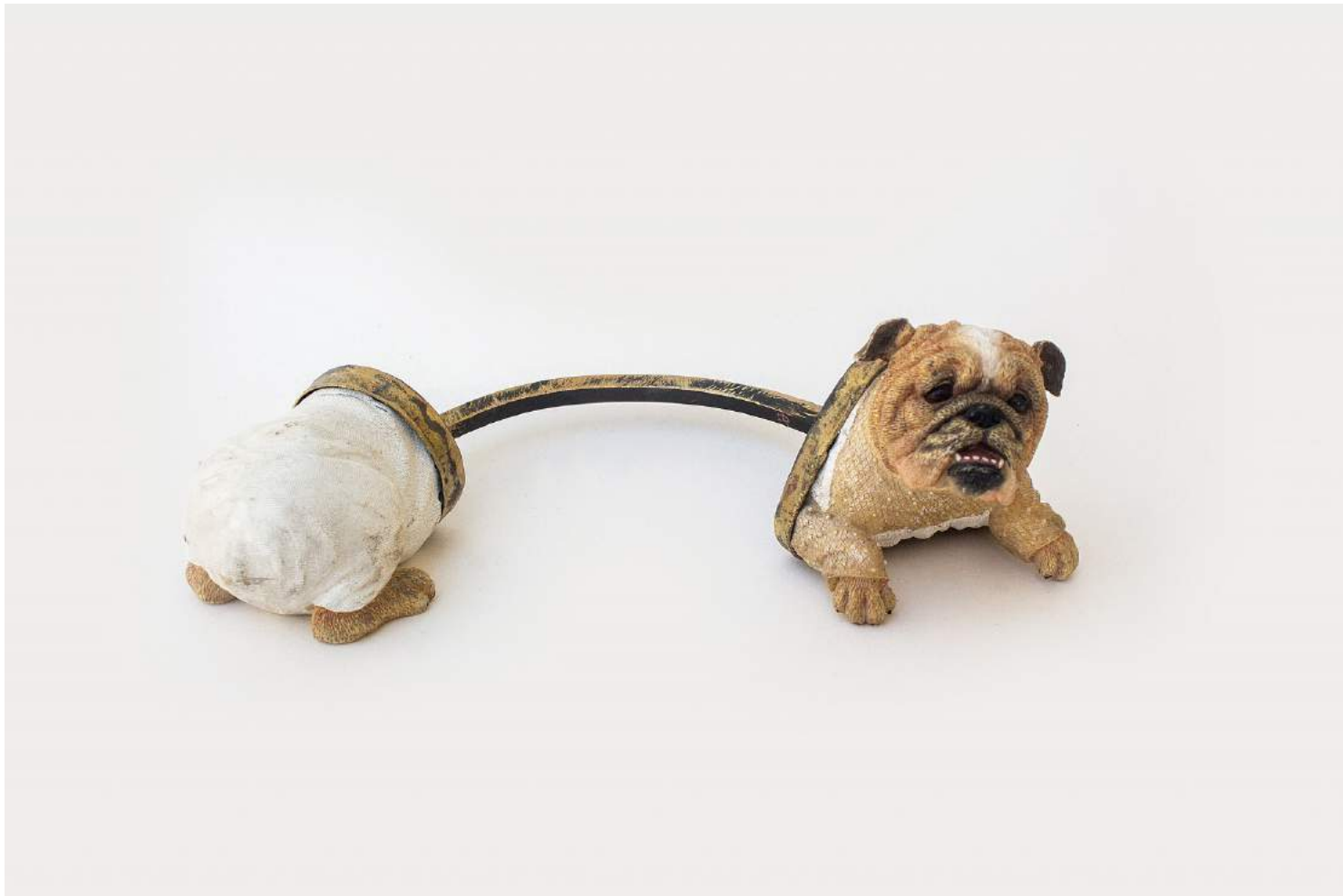
Affan Baghpati A New Cat In Town , 2021 Assemblage, found objects, brass, polymer resin 2.36h x 7w x 3.50d in