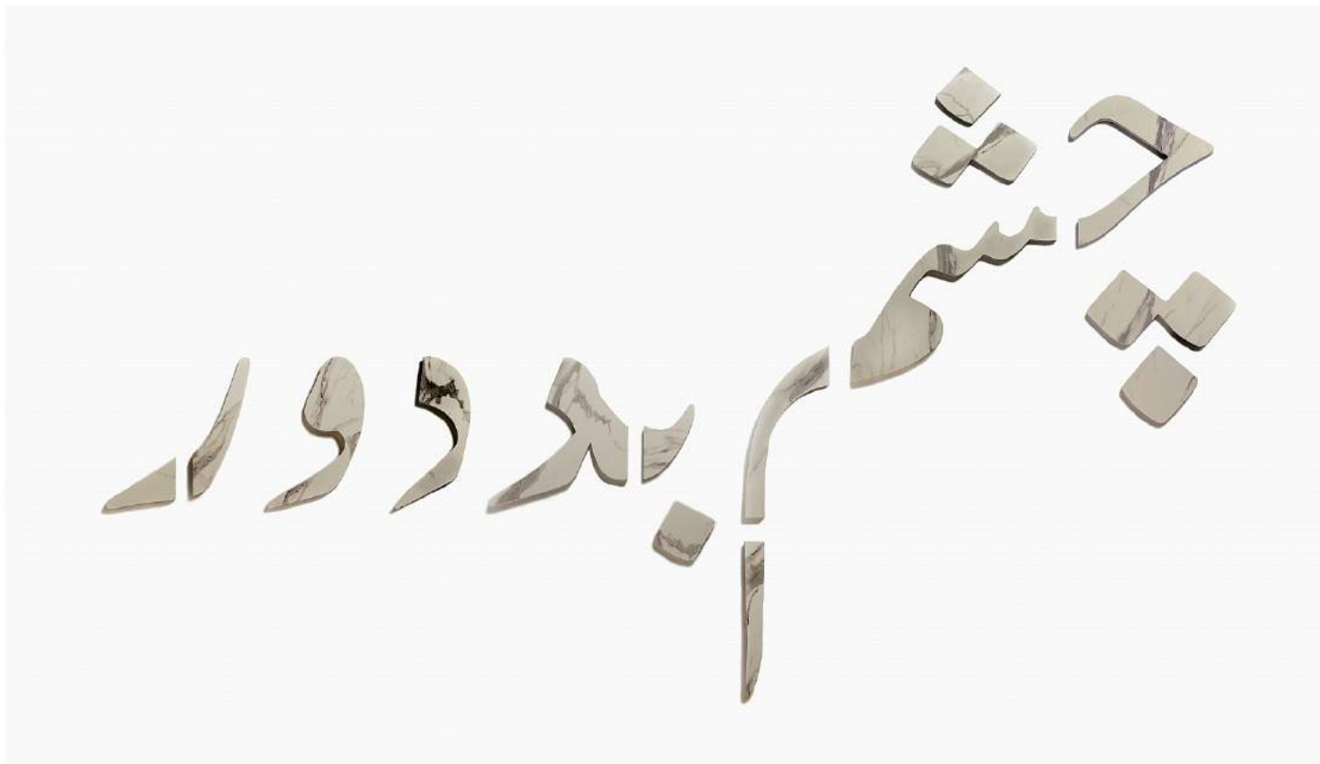
Affan Baghpati Chashm-e-baddoor , 2021 Laser cut ZRK high-gloss laminated sheet, archival acrylic 88h x 150w in