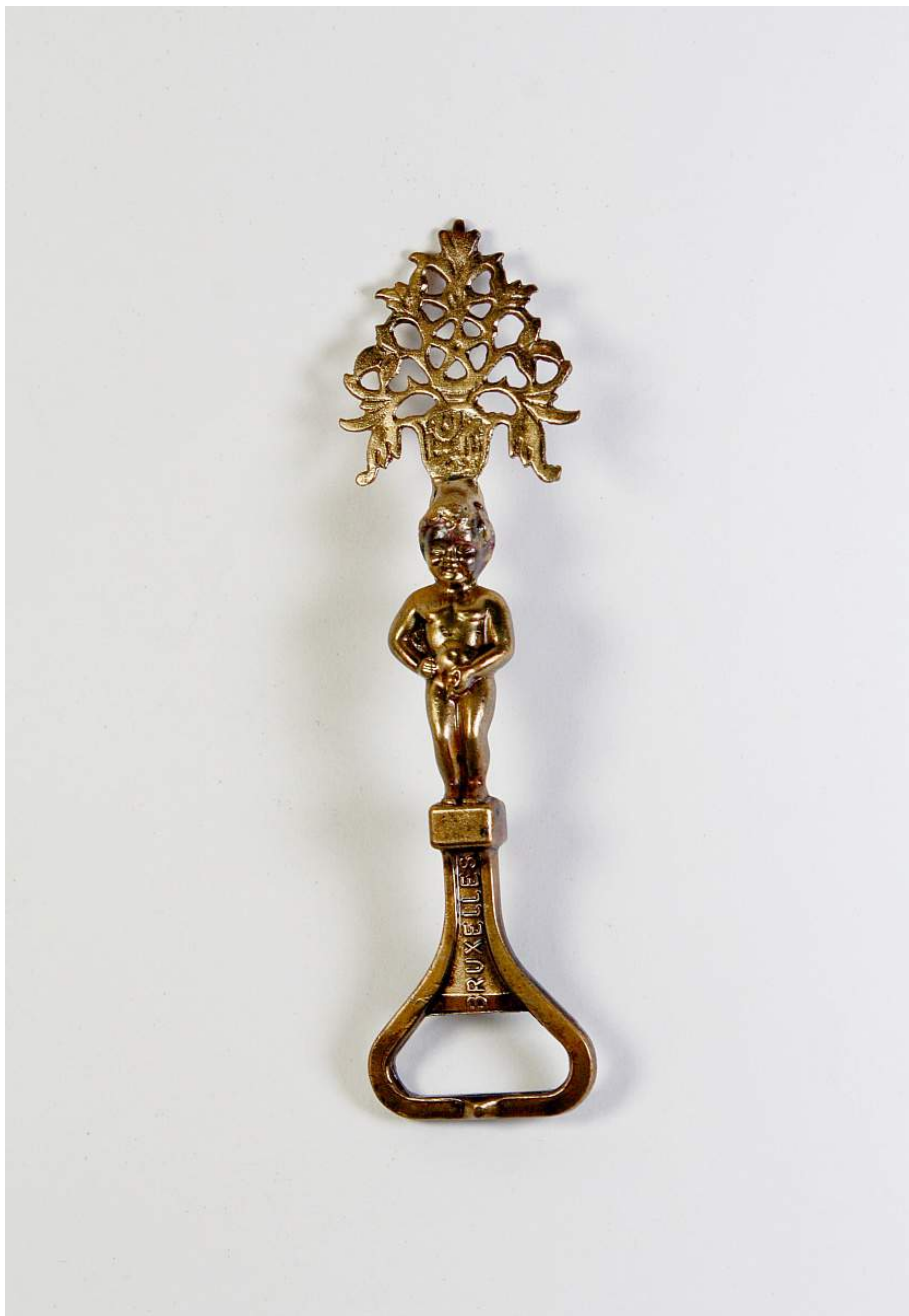
Affan Baghpati Hold On , 2020 Assemblage, found objects, brass 5.90h x 1.50w in