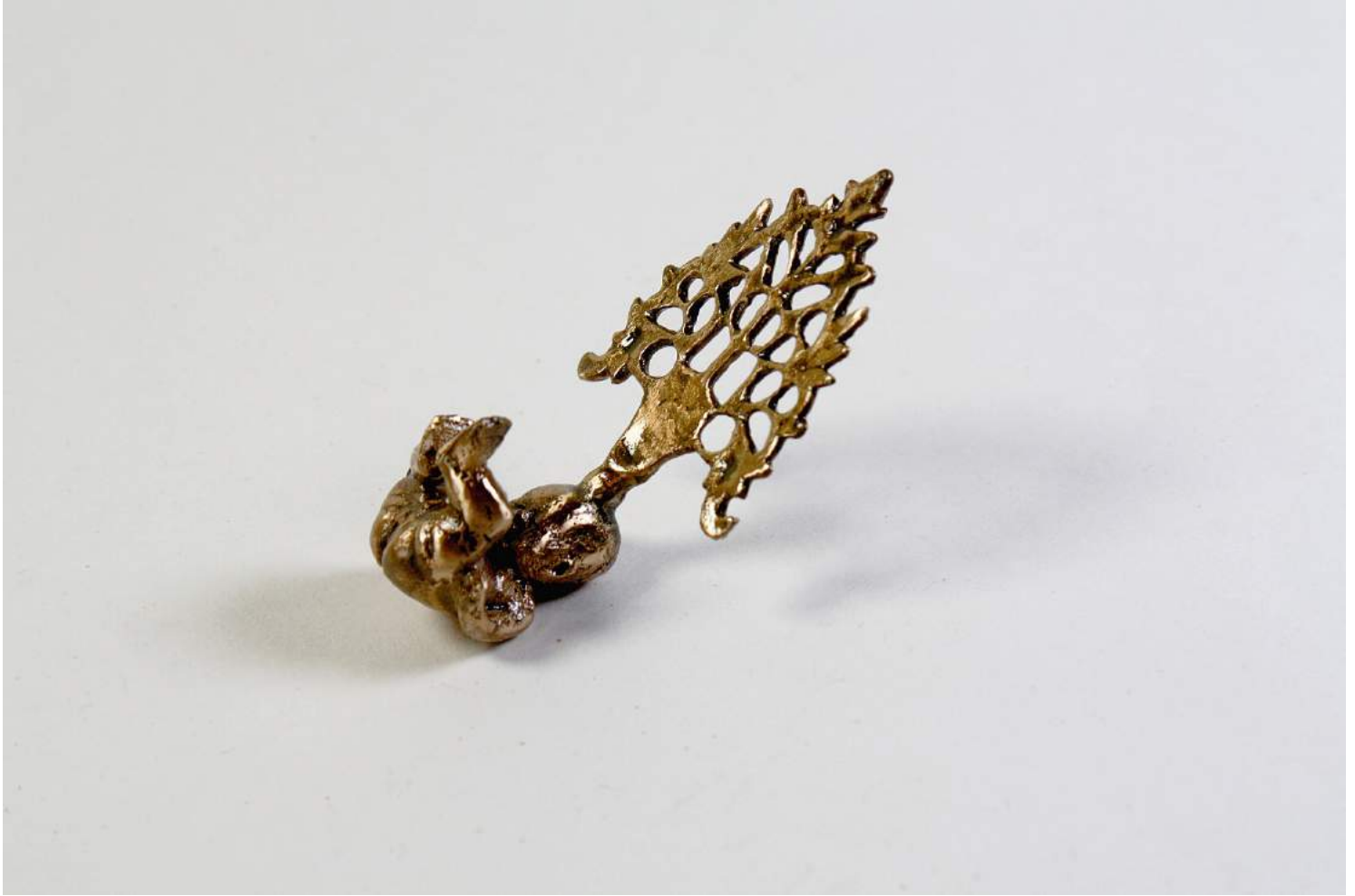
Affan Baghpati In , 2020 Cast, brass 2.55h x 1.18w x 1d in