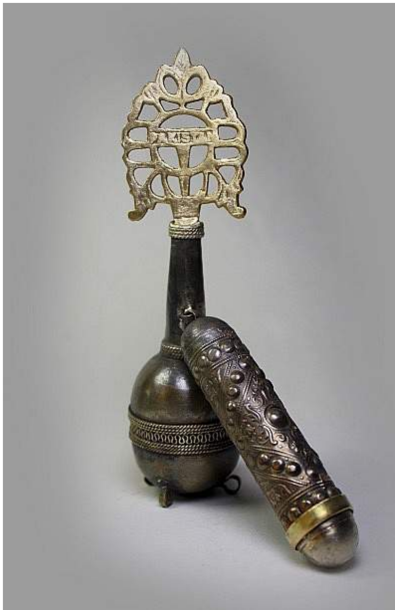
Affan Baghpati Thing , 2020 Assemblage, found objects, brass alloy 6.10h x 4.30w x 1.77d in