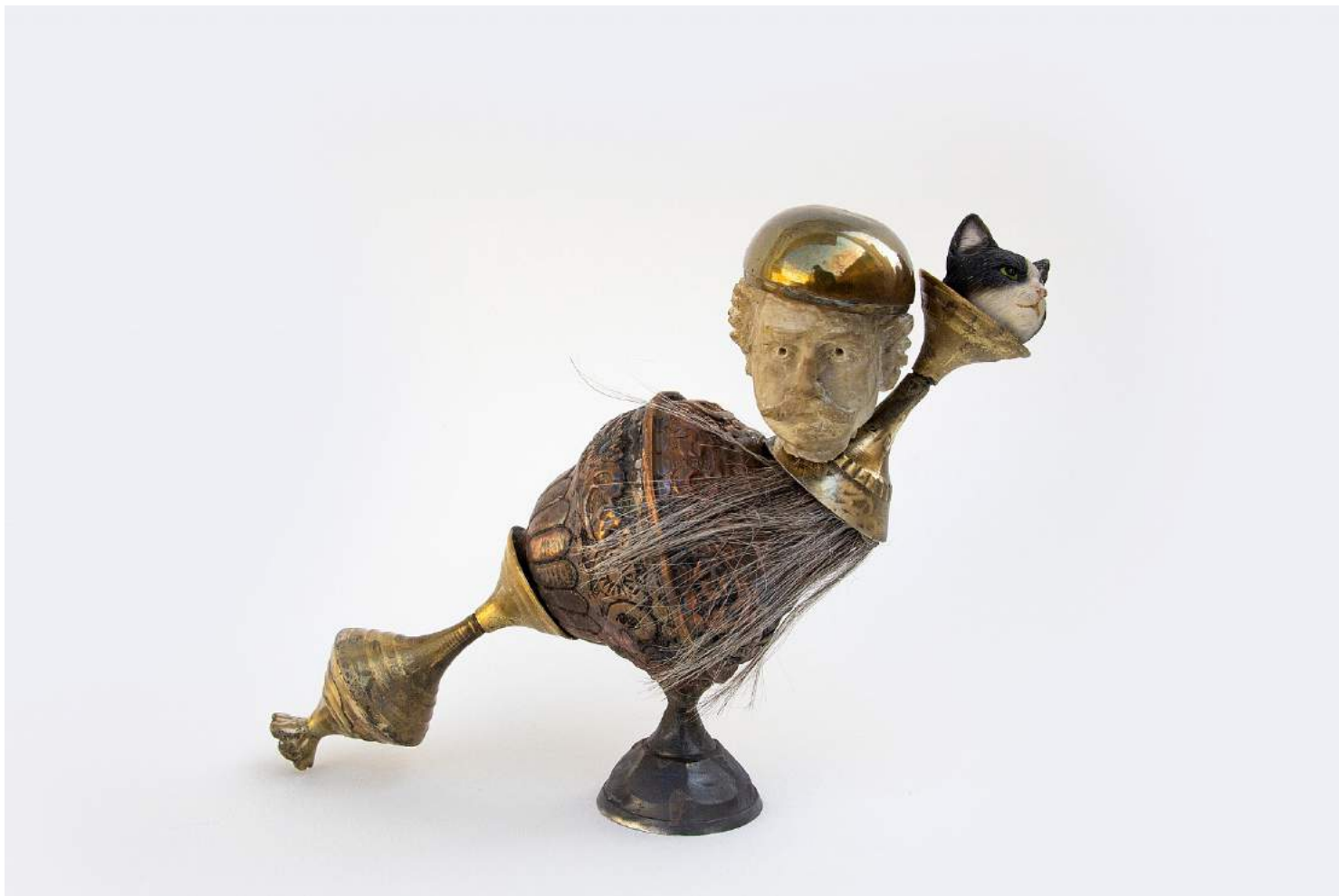
Affan Baghpati All The Things We Do , 2021 Assemblage, found objects, cast, brass, copper, polymer resin, epoxy 6.70h x 8.66w x 3.50d in