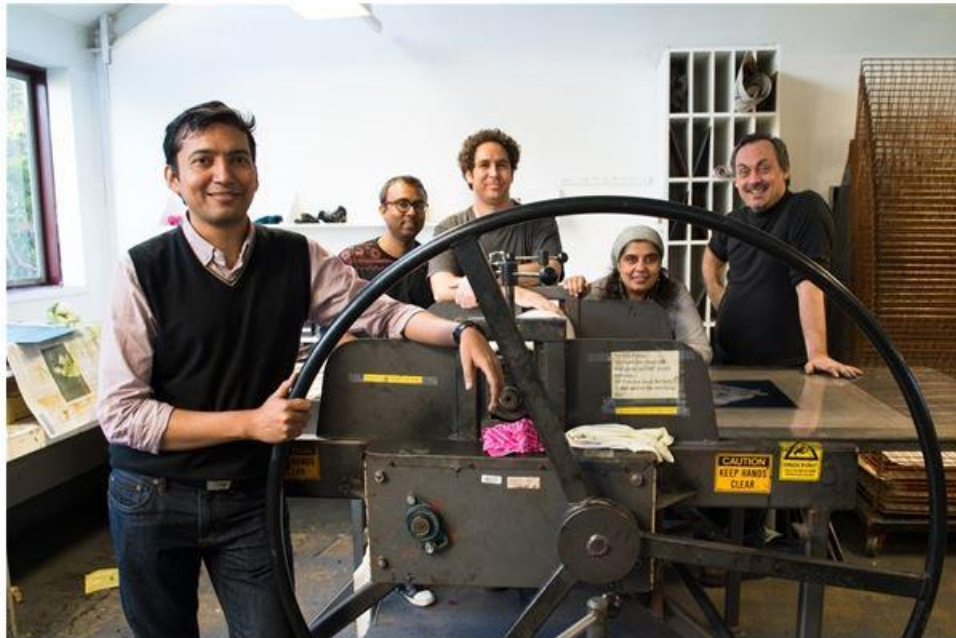
Semblance of Order artists