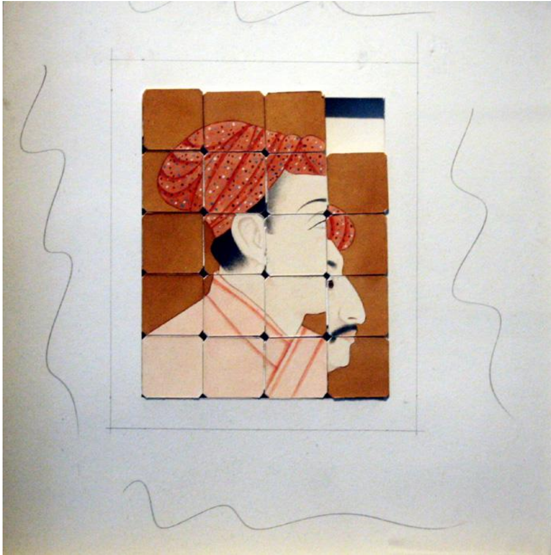
Amjad Ali Talpur, Face 2 , Gouache on 19 wasli squares, 5 x 4 in.