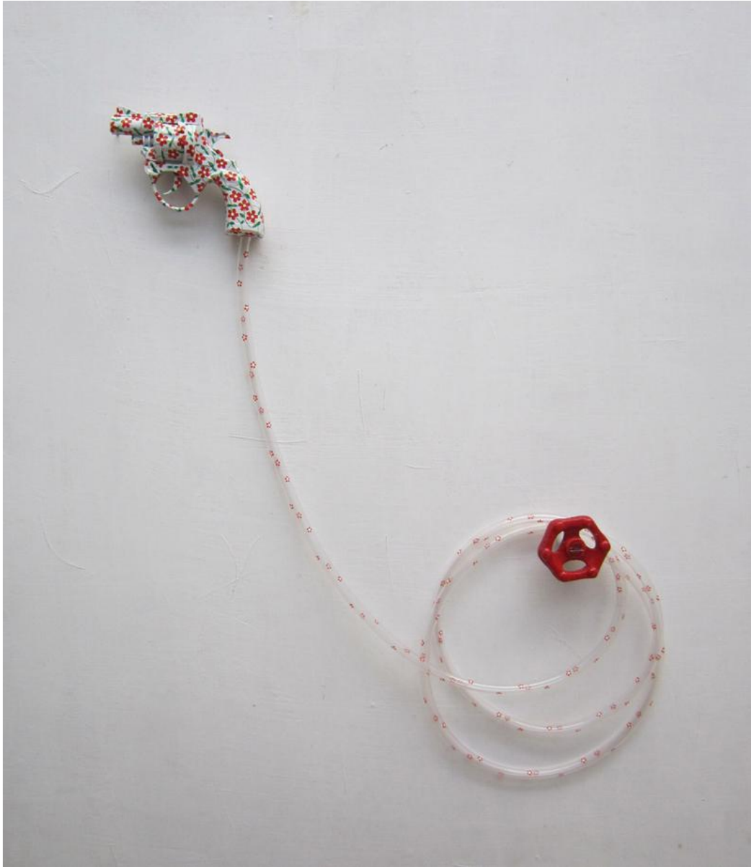
Sara Khan, Gul-Gum , 2011, Acrylic paint on toy gun, rubber hose and iron liver, Dimensions variable