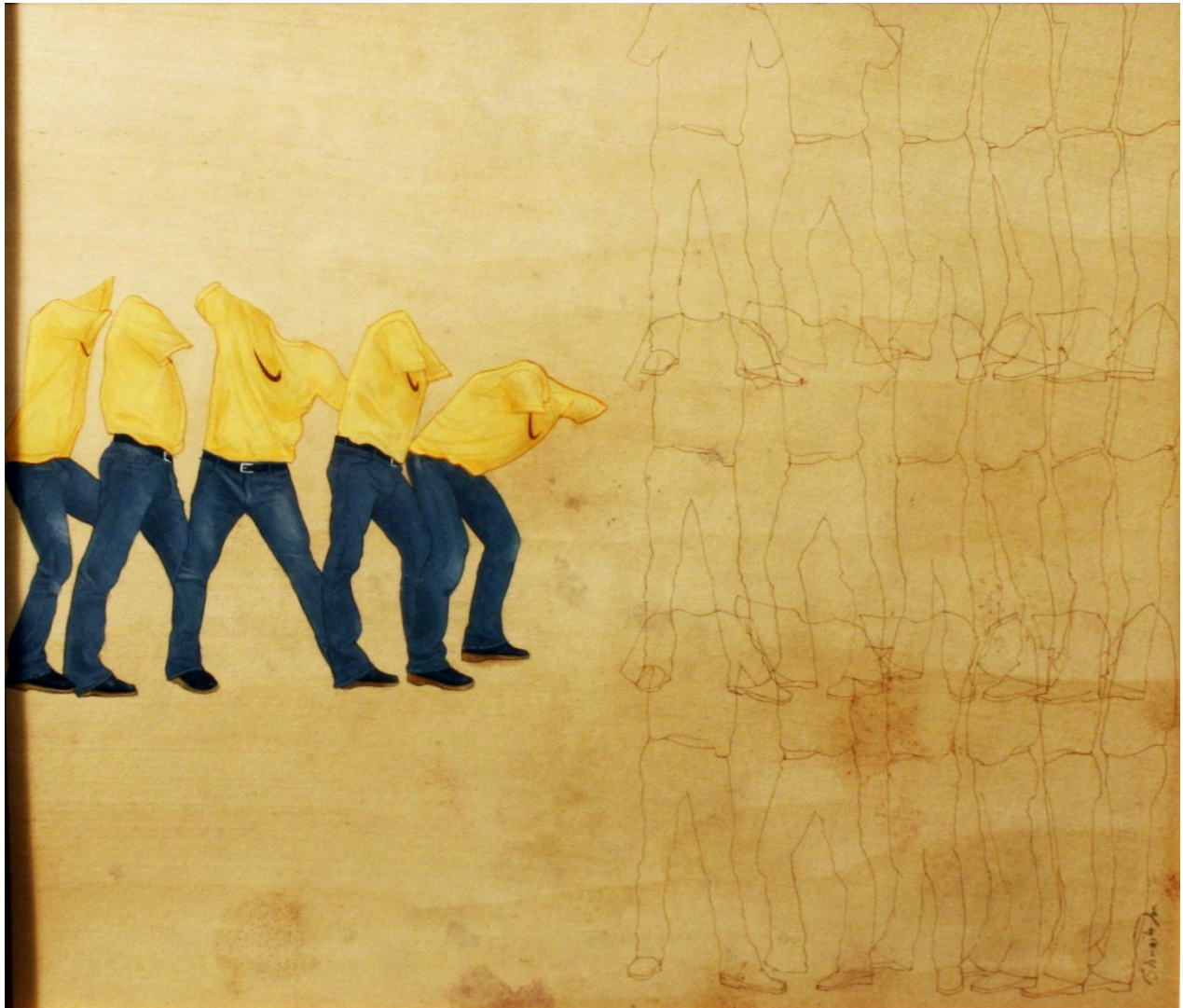
Shoaib Mehmood, Just Do It , Gouache on wasli, 5 x 8.5 in.