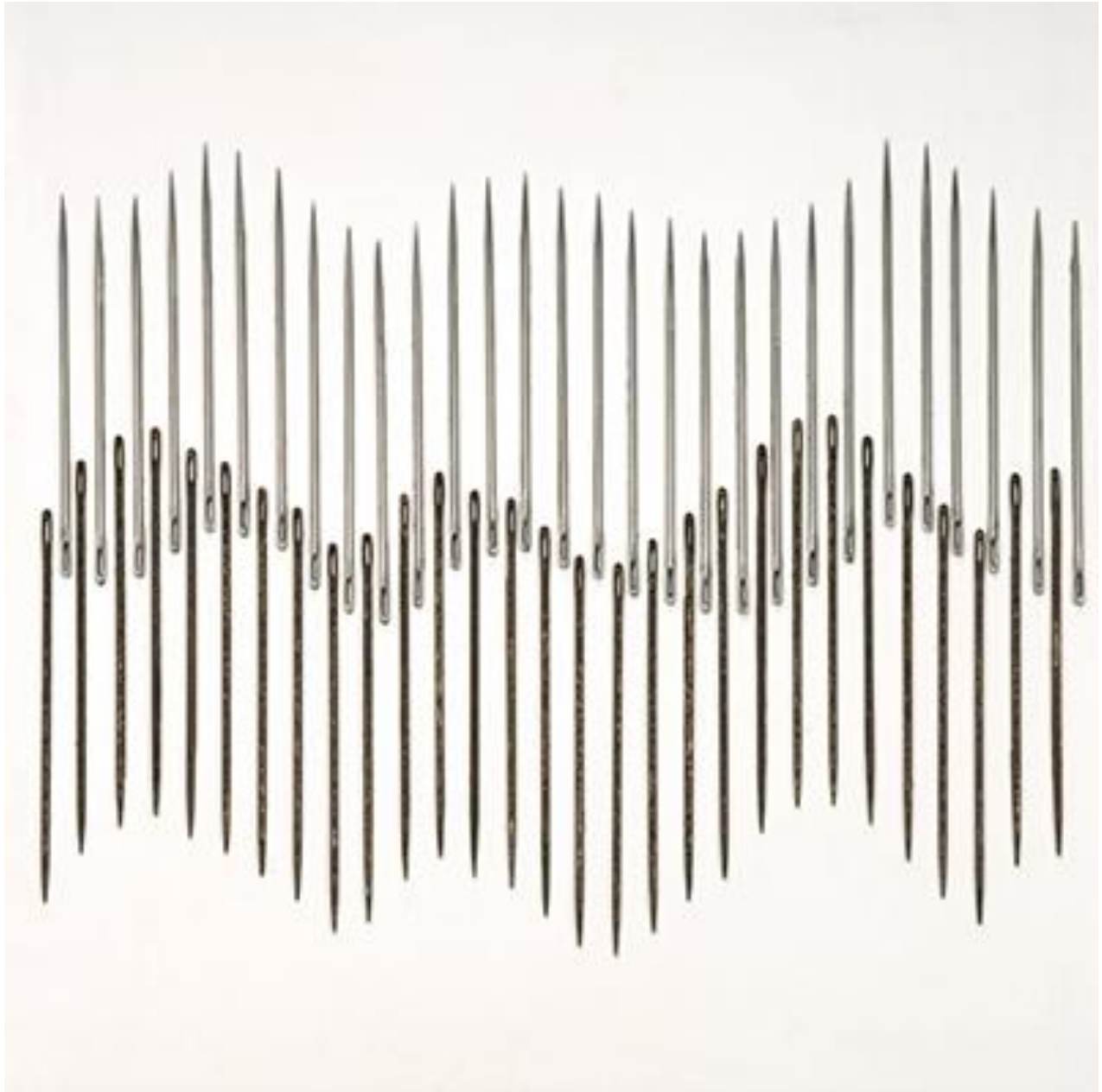
Roohi Ahmed, Two Nation Theory , 2009, Large metallic needles on board, 16.5 x 16.5 in.