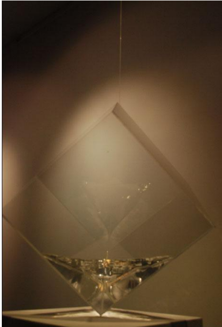
Iqra Tanveer, Breathing Space , 2010, Acrylic box, water and light, 12 x 12 x 12 in.