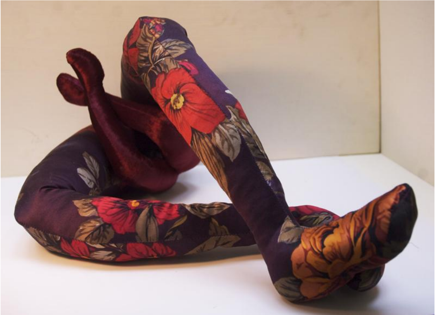
Cyra Ali, Specimen 1 , 2011, Fabric, polyester filling and wire, 16 x 7 x 10 in.