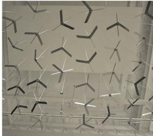
Abdullah M. I. Syed, The Flying Rug of Drones , 2009, Box-cutter knife blades and stainless steel, 48 x 96 in.