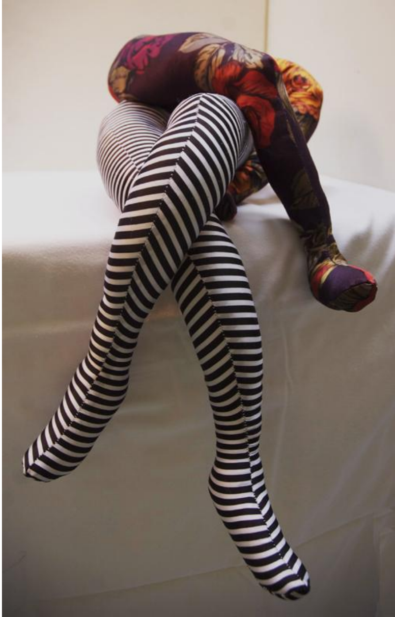
Cyra Ali, Specimen 2 , 2011, Fabric, polyester filling and wire, 15 x 18 x 10 in.