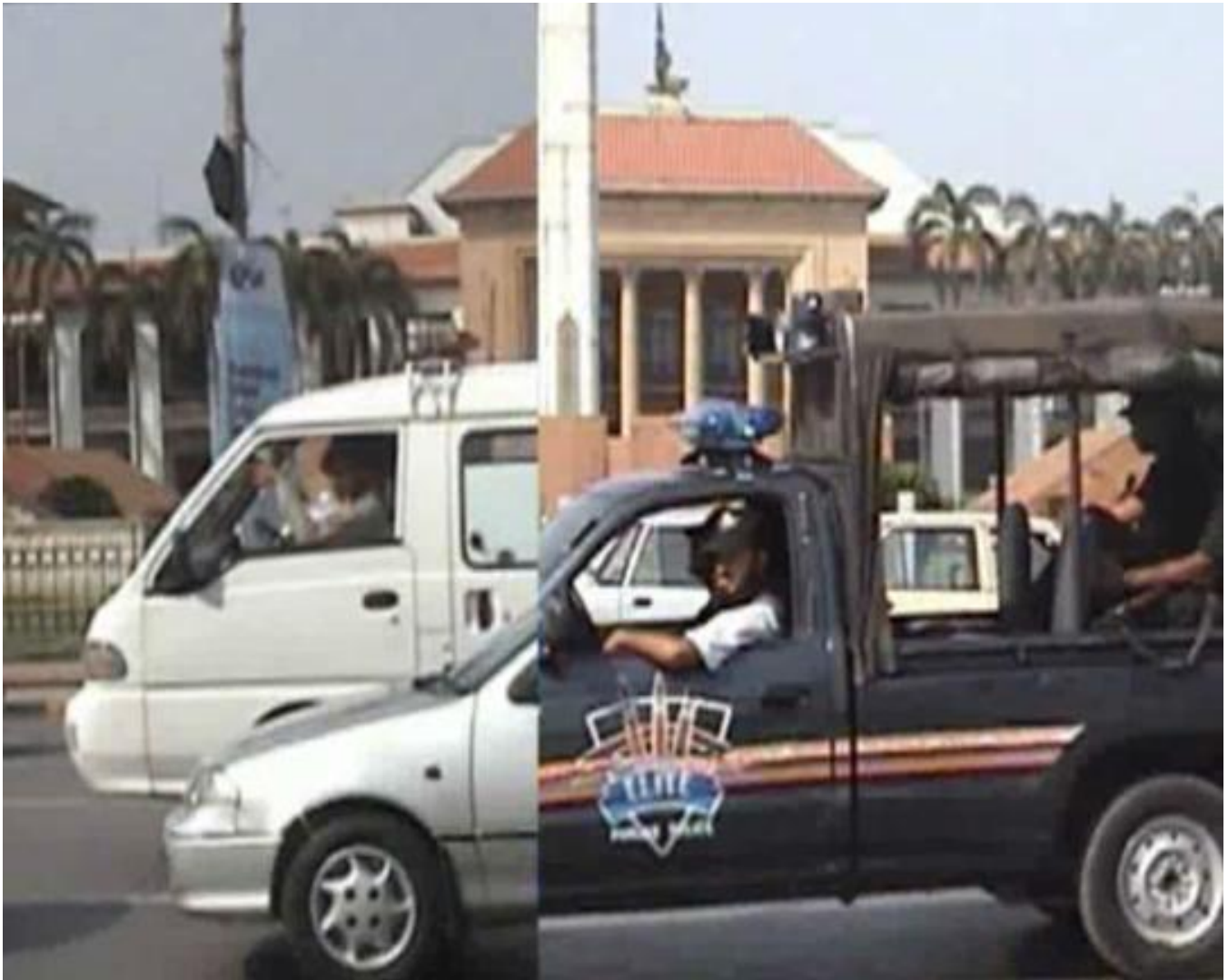
Hassan Mujtaba, Still from I Pass By This Way Every Day , 2006, Single channel video, 1:06 min.