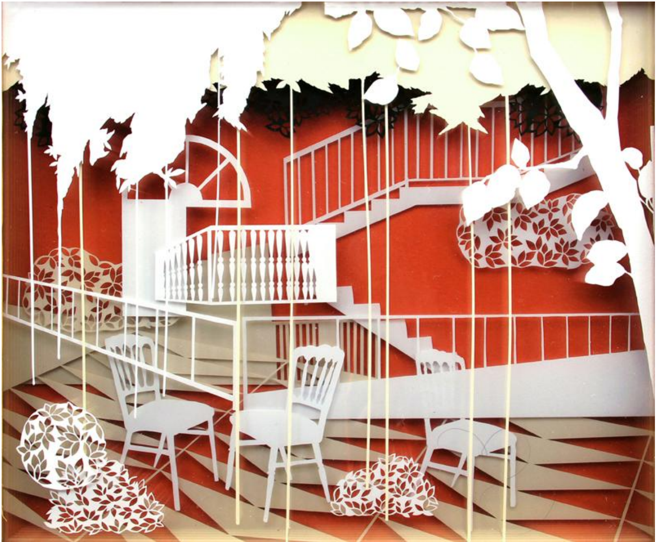
Seher Naveed, Evening Conversations , 2011, Paper cuts, 15 x 18 in.