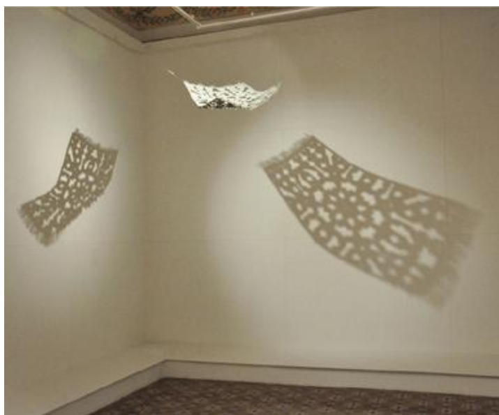
Abdullah M. I. Syed, The Flying Rug IV (Installation View), 2011, Folded U.S. one-dollar bills and staple pins, 31.5 x 51.5 in.

Aicon Gallery New York is proud to present Méré Humd(r)um , a group exhibition of Contemporary art from a new wave of young Pakistani artists. The Urdu word Humdum , one syllable removed from its mundane English cousin, means someone who is so close that their breath and yours are one. The word Méré , with even less separating it from the minimal, almost pejorative, “mere” of the English language, is infused with belonging - it means mine. Together, Méré Humdum becomes a term of endearment for a mentor, a friend or a lover. But in a linguistic coincidence it is just a syllable away from the English “mere humdrum.” Today, more than sixty years after Pakistan’s independence, the ordinary, the everyday, the humdrum, remains an object of longing for most Pakistanis - the type of longing one might reserve for a lover. A