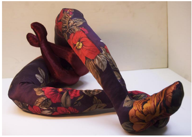
Cyra Ali, Specimen 1 , 2011, Fabric, polyester filling and wire, 16 x 7 x 10 in.

Cyra Ali's haunting sculptures of disembodied intertwined limbs adorned in bright fabrics obtained from Karachi bazaars are a daring subversion of the overtly clad female body of Islamic tradition. The work stems from her desire to overturn the conventional trappings of femininity in Pakistani society and combat longstanding patriarchal desires to repress female sexuality. Ali's bizarre doll-sized mash-ups of female legs blur the line between the most ordinary of body parts and the sinister and monstrous proportions they are capable of taking on when continually contextualized as taboo objects of desire to be both coveted and suppressed. More straightforwardly, Sarah Khan's art is born from her resolute devotion to Pakistan, her beloved State, and her desire to see its artistic traditions, mainly miniature painting, evolve to address the socio-political complexities of its contemporary reality. She addresses her humdum (her Pakistan) for its charm and fading glory as she fortifies her wish for its resurrection from a negative entity to a positive one.