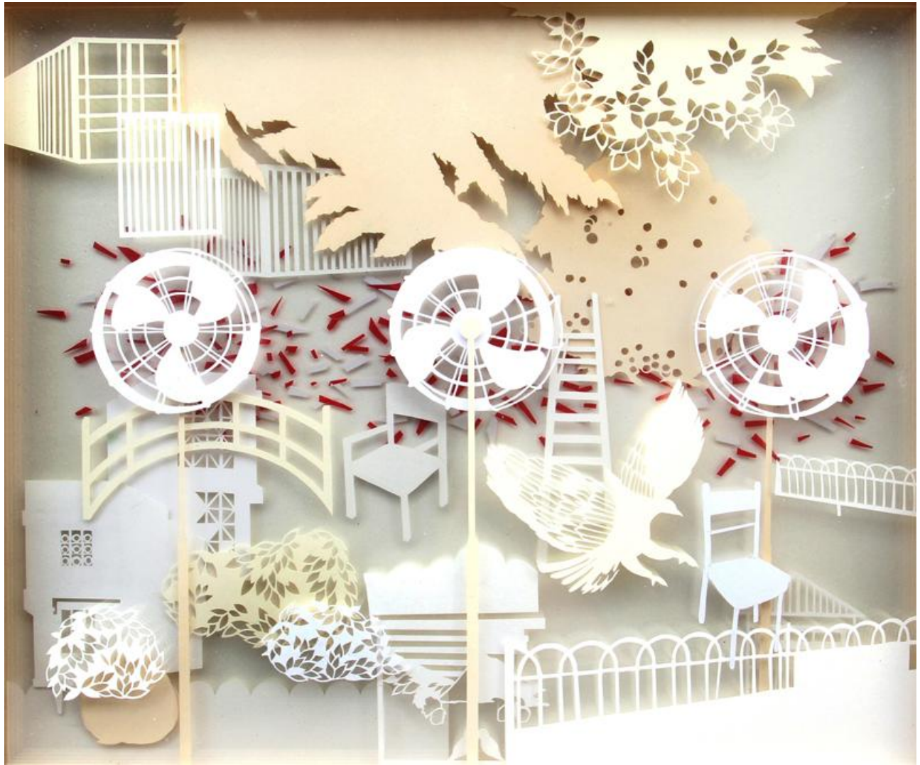
Seher Naveed, Between the Event and Its Interpretation , 2011, Paper cuts, 15 x 18 in.