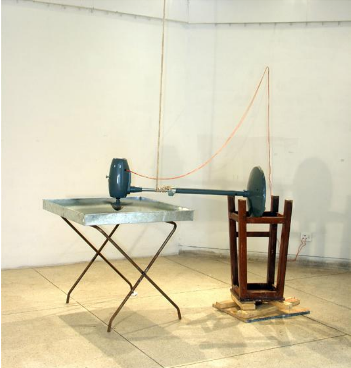
Ehsan ul Haq, Fan and Water , 2008, Pedestal fan, metal container and water, 52 x 42 x 42 in.