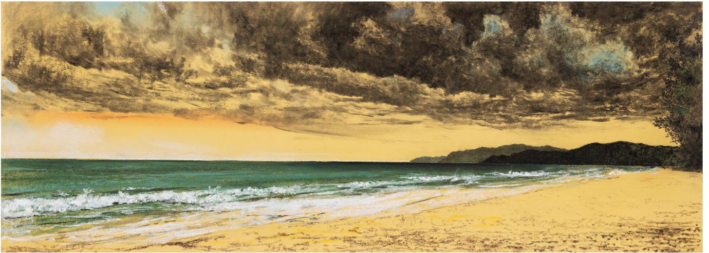
Nikhil Chopra Untitled, 2021 Mixed media on paper 14 x 39 1/2 in