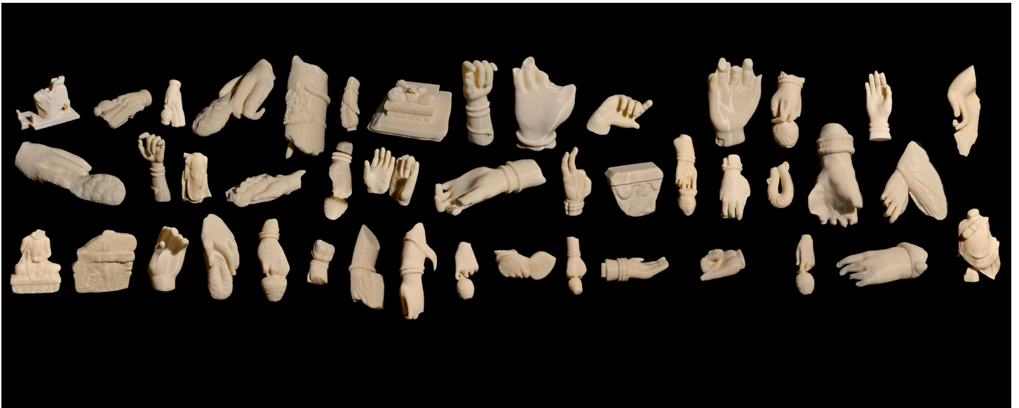
Shaurya Kumar The Case of Broken Hands, 2021 ABS (acrylonitrile Butadiene Styrene), 40 pieces dimensions varied